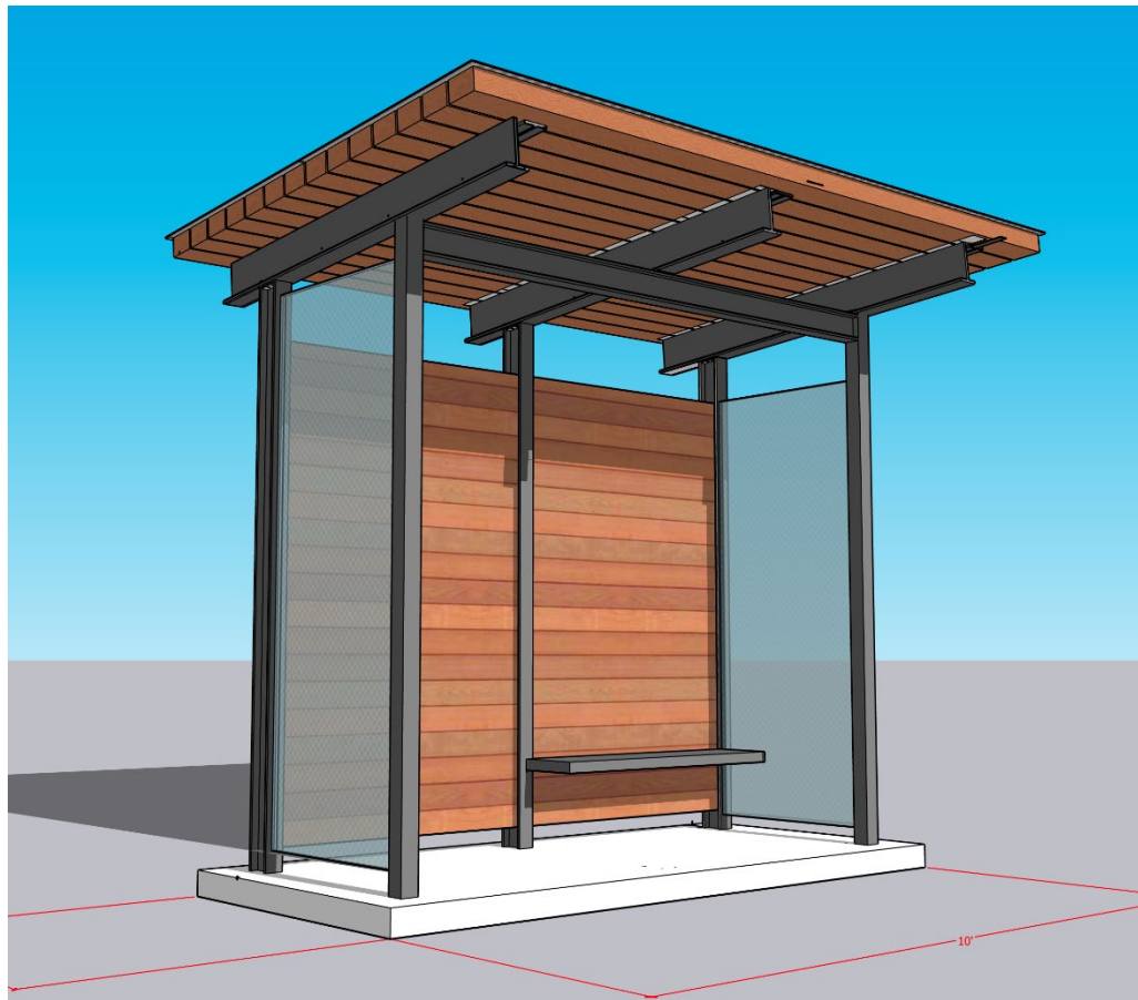
4x8 Shelters have two wooden panels