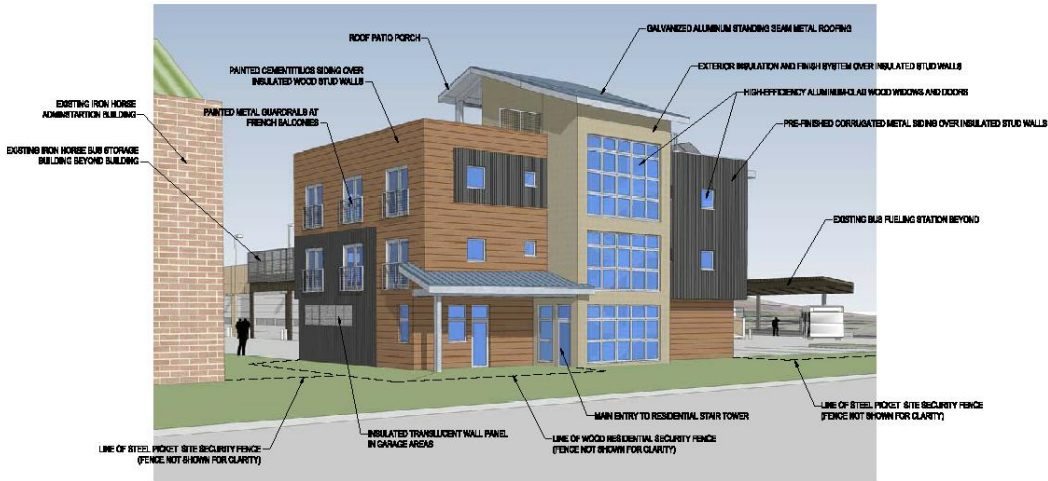
MODEL VIEW FROM SHORT LINE ROAD - LOOKING SOUTH EAST NO SCALE